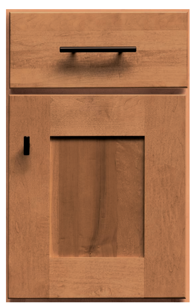
Contemporary Pull and Knob F in Matte Black (Iconic) Rigby Flat Panel in Sandalwood on maple with Slab Drawer Front