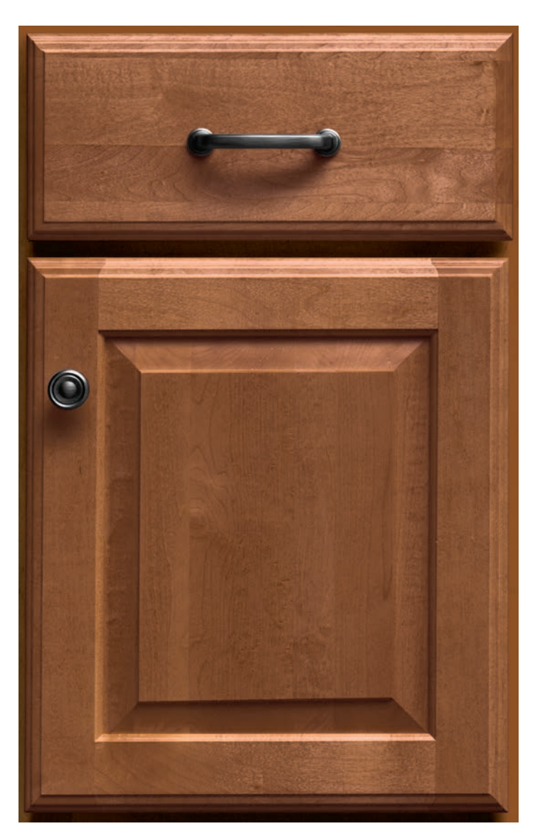
Traditional Pull and Knob A in Brushed Pewter (Iconic) Crowley Raised Panel in Amaretto on maple with Slab Drawer Front