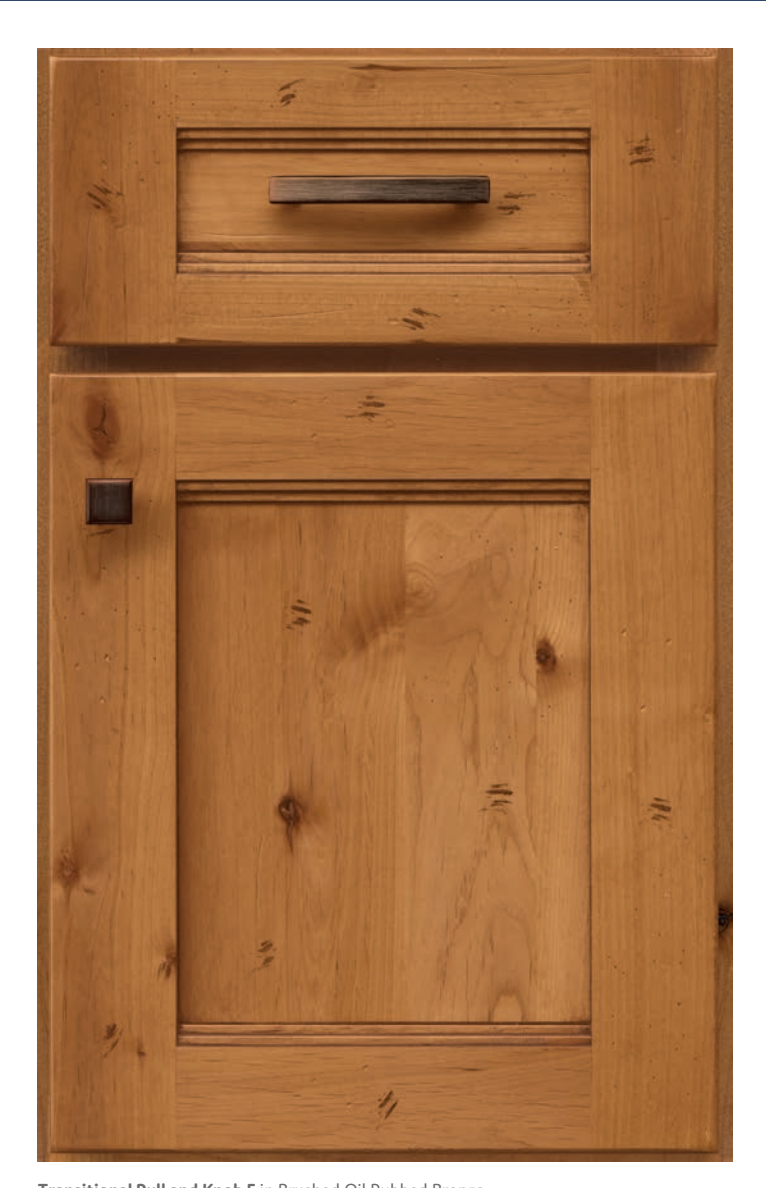
Transitional Pull and Knob F in Brushed Oil Rubbed Bronze (Gold) Brockton Reverse Raised Panel Natural Burnt Sienna Glaze and Highlight Antique on knotty alder